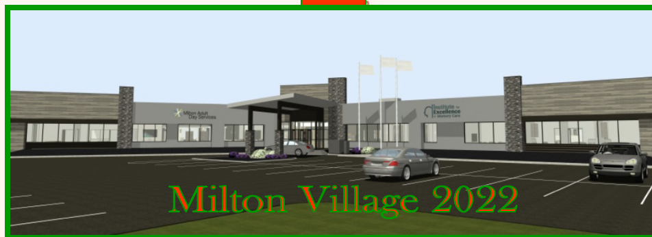
Milton Village 2022