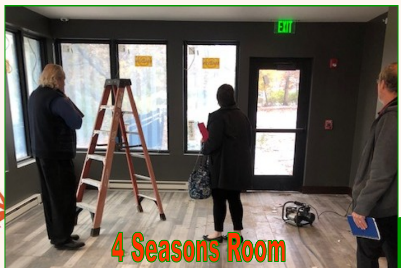
4 Seasons Room