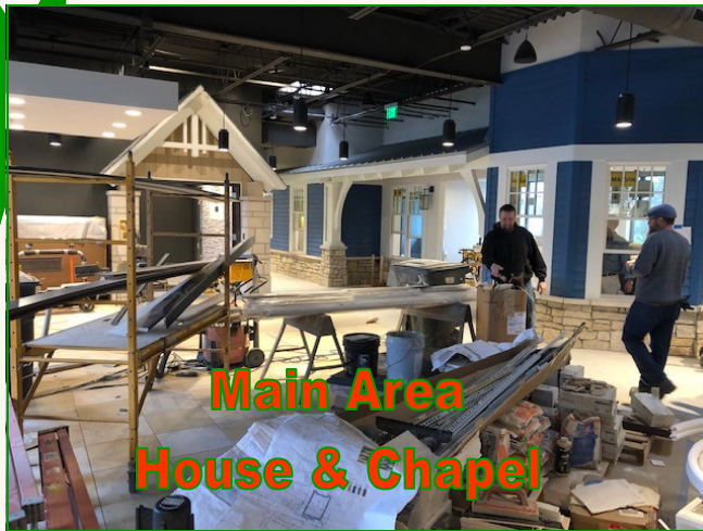
Main Area House & Chapel